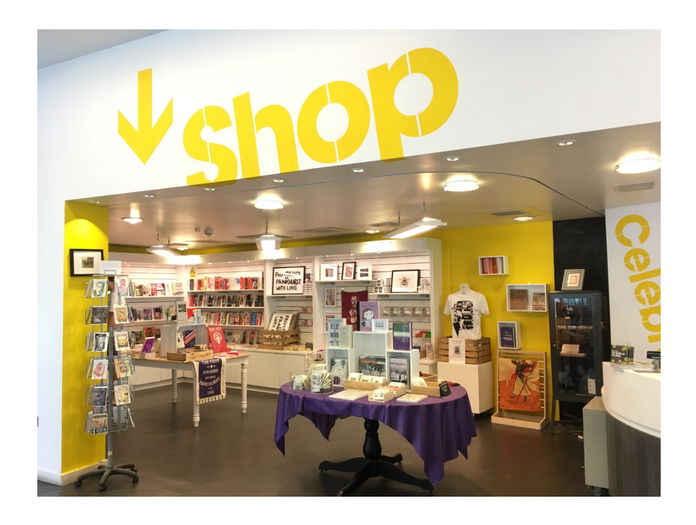
There is also a shop on the ground floor