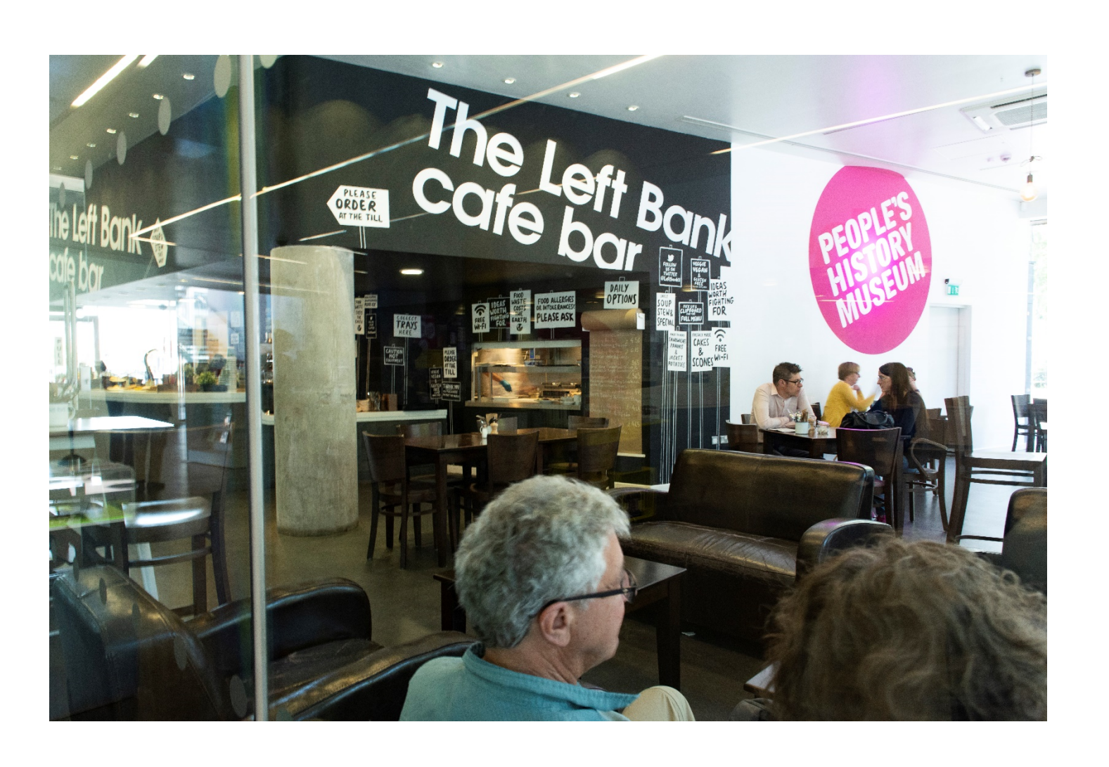
There is a cafe on the ground floor