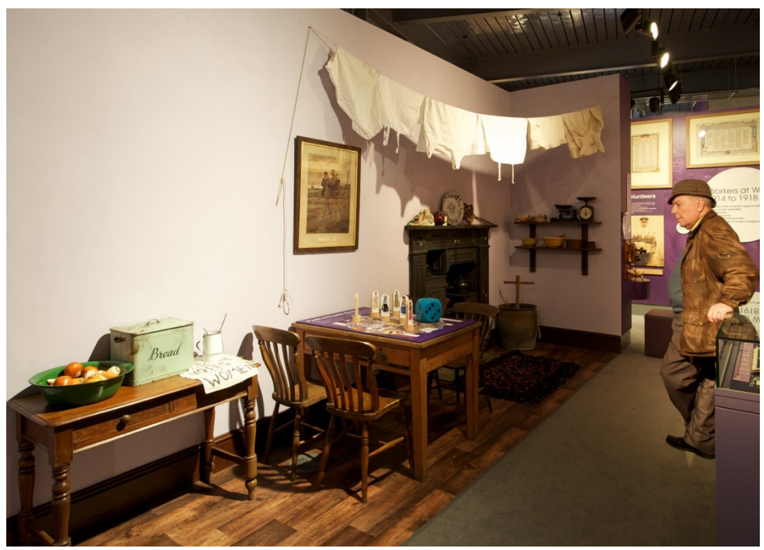
Main Gallery One