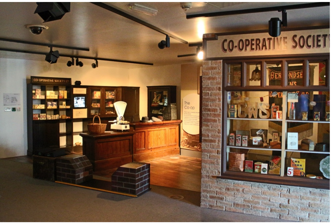
Main Gallery Two