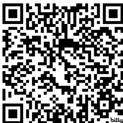
Figure 3. Scan this QR Code for more info

To learn more about the SEND and Alternative Provision Improvement Plan, please visit https://bit.ly/send-ap-improvement-plan or visit this Gov.uk link for a downloadable easy-read version.